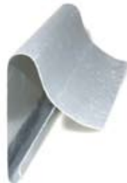
Raised edge trim Available in 3m lengths