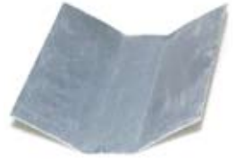
Wall Fillet Available in 3m lengths